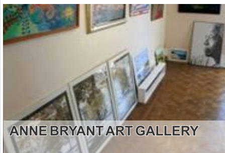
ANNE BRYANT ART GALLERY