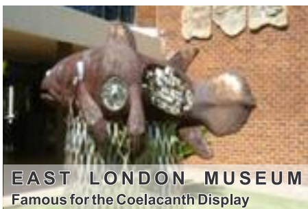
EAST LONDON MUSEUM Famous for the Coelacanth Display