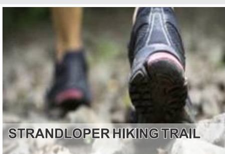
STRANDLOPER HIKING TRAIL