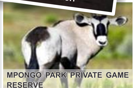
MPONGO PARK PRIVATE GAME RESERVE