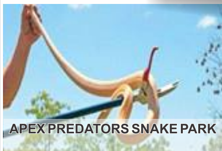
APEX PREDATORS SNAKE PARK