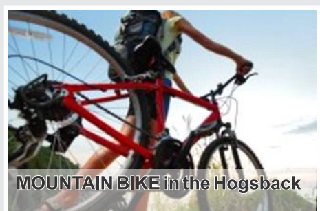
MOUNTAIN BIKE in the Hogsback