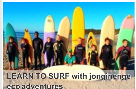
LEARN TO SURF with jonginenge eco adventures